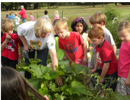
Harvesting with Kindergarteners

When: You may tend your garden plot on your own schedule. We strongly encourage year-around planting and maintenance of your garden bed. Join the garden anytime for a prorated fee. General sign-up and renewal every January. Contact the garden team now to request a plot! Review garden contract at: www.Westwind-Church.org/Community_Garden.html .